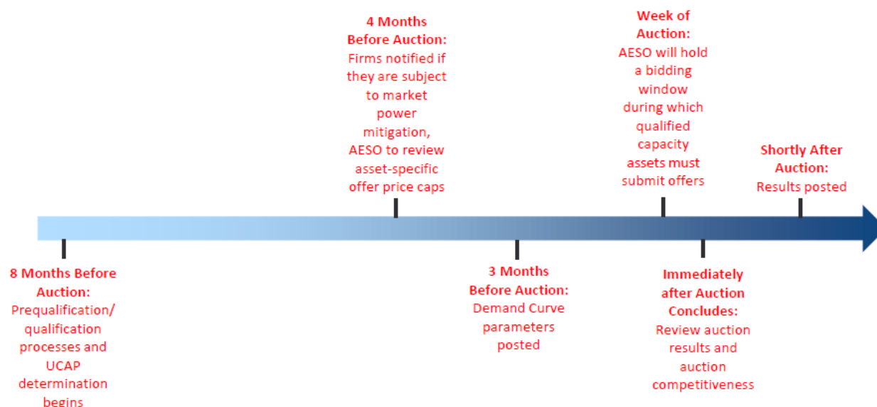
Figure 1 – Base auction timeline after transition period is completed